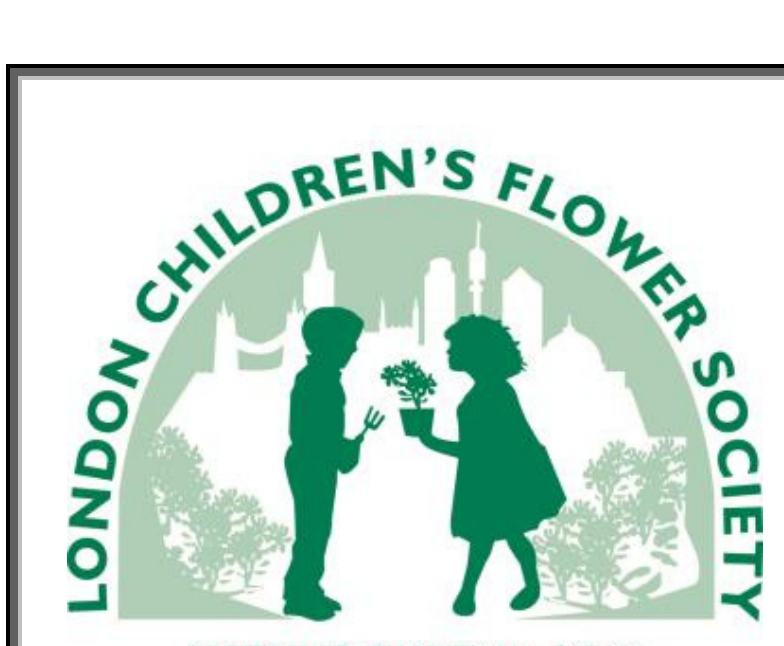
REGISTERED CHARITY No. 249444

The London Children's Flower Society are excited to announce the launch of their 'Front Cover Competition' where they invite London schoolchildren to design the front cover of their next Annual Report. The report is sent out to schools, donors and supporters around the city.